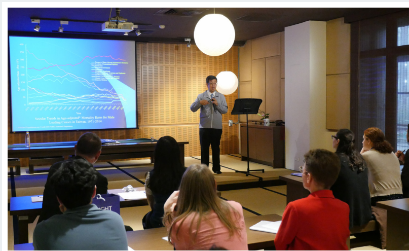
Vice President-Elect Chen, gives a keynote speech titled “Public Health Issues in Taiwan” at the Fulbright Cross-strait Research Workshop in Taipei

傅爾布萊特計畫成立於1946（民國35）年，由阿肯色州參議員傅爾布萊特先生提案。記取二次世界大戰的教訓，他相信通過教育與文化之交流，讓美國與各國人民相互了解，將有助於增進世界和平。傅爾布萊特計畫的目的是「增進美國政府、美國人民與各國人民的相互了解」。每年提供獎學金與美國及各國公民，支持高等教育講學、研究、進修與專業人才交流等各種教育活動。從1946年起，全球已經有超過36萬人次獲得傅爾布萊特獎學金。至今，這個計畫是美國與全球超過155個國家間最龐大也最知名的教育交換計畫之一。獲獎者中共有54位諾貝爾獎得主及82位普立茲獎獲獎人。